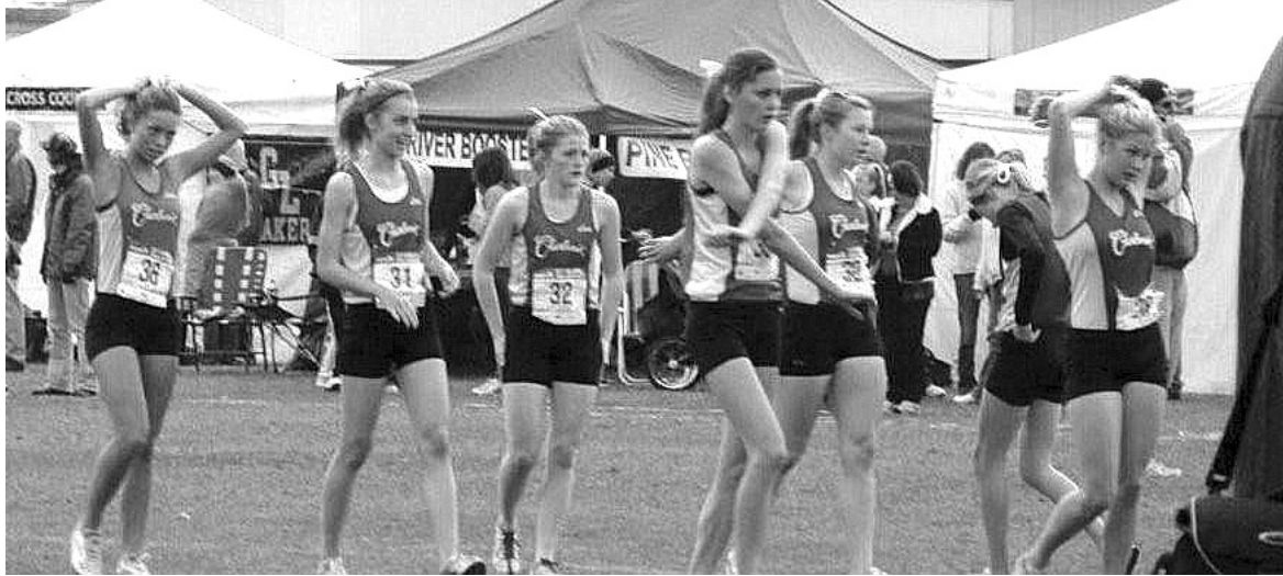
The Charlevoix Rayders girls team stretches in preparation for the race.